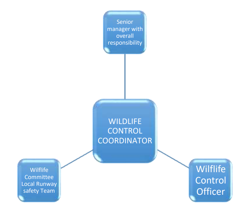
Figure 9 - Wildlife Management Plan Support/Responsibility Structure