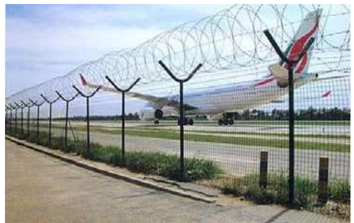
Figure 4 Well-maintained fence, no gap at the bottom