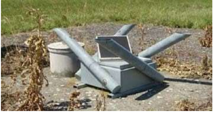
Figure 6- An underground stationary gas powered noise generator

5.10.4 Various new methods for either habitat management at airports, detection systems or new dispersal techniques have been developed in the past years. There are many methods of wildlife dispersal available. Aerodrome operators should assess the need before purchasing equipment.