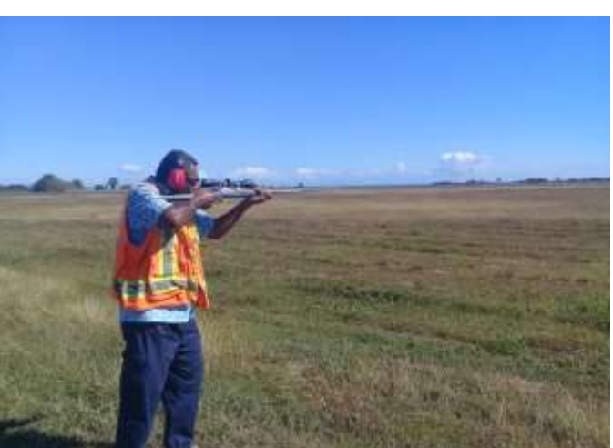
Figure 3Wildlife culling at Nadi International Airport

construction. This may include denying resting, roosting and feeding opportunities for hazardous birds/wildlife.