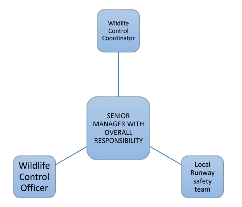
Figure 8 - Wildlife Management Plan Support/Responsibility Structure