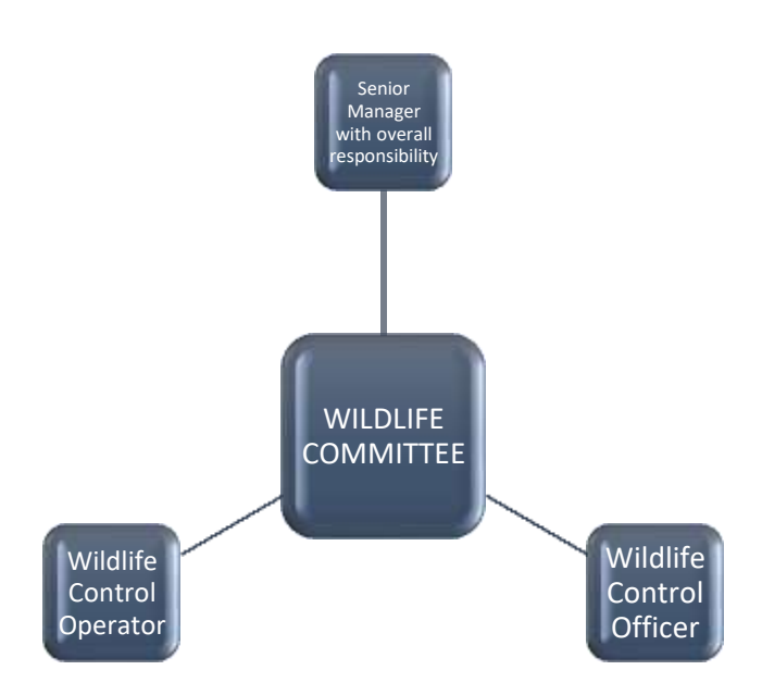
Figure 10 - Wildlife Management Plan Support/Responsibility Structure