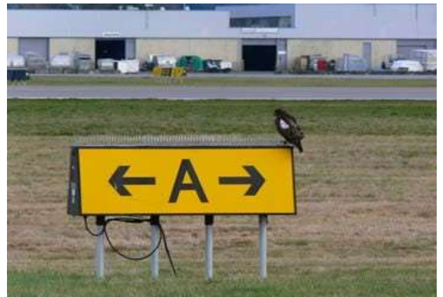
Figure 7 Deterrent Spikes don't keep all birds off of signs.

5.11.1 The classic challenge for wildlife hazard management is that most animals will become accustomed to certain dispersal interventions or find new ways to settle themselves safely in the airport environment. Therefore, it is vital for airport operators to continuously adjust and vary the measures taken. An airport should proactively seek different or new ways to reduce the wildlife hazard.